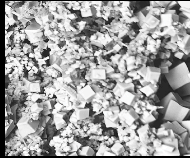
Microscopic view (x5000) of well developed copper hydroxide {Cu(OH) 2 } protective layer formed on the inner surface of TALOS® copper tube.

The cleaning method applied in TALOS® copper tubes is simple and effective. Air is enriched with pre-calculated amount of oxygen and is forced into the tubes at temperatures that exceed the lubricant’s flash point. The result of this cleaning process is a tube surface fully covered with copper oxide, whilst the lubricants have been decomposed and “burned” by the excess of oxygen. This in effect facilitates the formation of the copper hydroxide {Cu(OH) 2 }, when water is introduced in the installation.